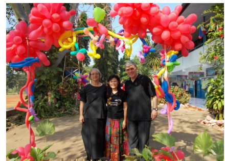
At the New Year Celebration with the Director of our school

It was planned to have a Christmas Celebration for the school at Tuesday 25 th . The day before, however, this celebration was cancelled, because there were no regular lessons in so many days during the last weeks. (We calculated at least 10 days of a total of 38 since the beginning of the second term in November.) Instead of it there was a celebration at December 28 th , for both Christmas and New Year. That celebration was about fun and food, but we heard nothing said about the meaning of Christmas. For the 25 th we were told to speak in our English lessons about Christmas. We did that, and the pupils, especially in class 4, listened very attentively