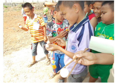
Don't drop the balls when you run!

For lunch there were noodle soups with vegetables and meat balls or fish balls and orange drink and strawberry drink. Reiner told about what Christmas is and what it means for us. He had to do it in Thai. Then we had games in the garden with very eager participation. Afterwards we let collect all the garbage thrown away before we distributed the gifts. The children got a package of coloured pencils each, because we had often found in school, that children had either no coloured pencils or some mis-erable remnants only. We could distribute 105 packages. We hope very much, that the Good News we proclaimed put down roots in the hearts and minds of those who came and bring fruit.