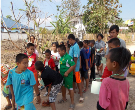
Attending the games to start.

behaved this year. We sang "Joy to the World", a Christmas song we had taught nearly all our classes at school during the weeks before.