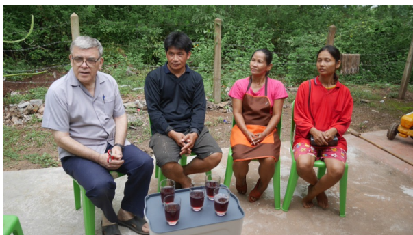
Our 3 workers