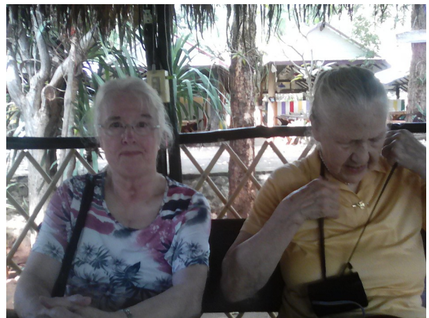
Our visitors from the Netherlands