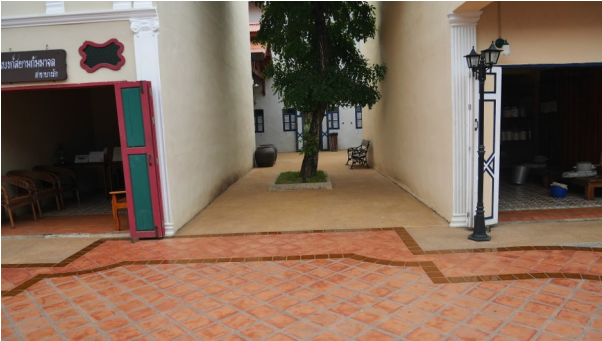
Mallika: Streets in the City and ...