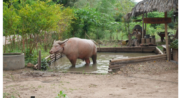
... a water buffalo