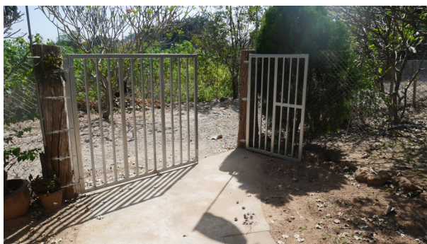
The new door in front of our main house