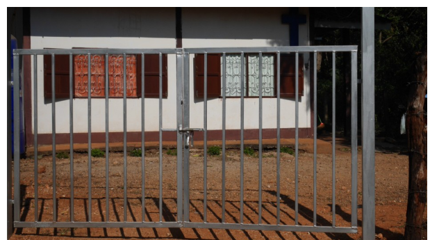
The new entrance door of Ban Jaiyairak