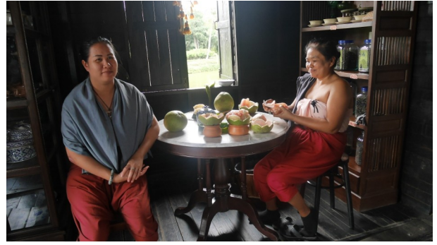
... live persons in traditional garb