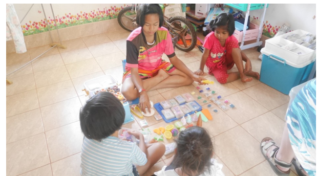
Children play selling and buying.