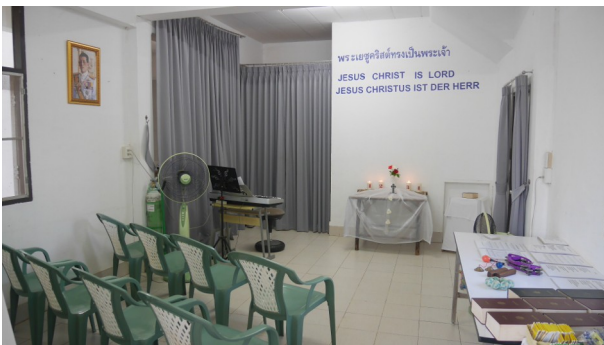
Before our Service at the 3 rd Advent Sunday