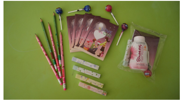
Christmas gifts for girls