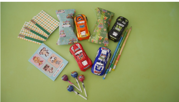
Christmas gifts for boys