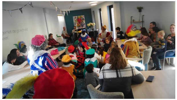
Dutch Nikolaus celebration