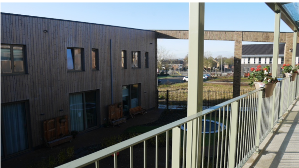
house of the Leefgemeenschap Bethanie: The families live at the left, the sisters at the right side.