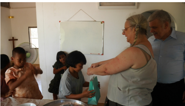
... Christmas Gifts, but ...