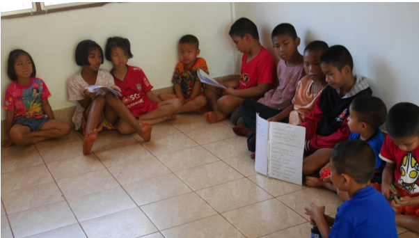
... Singing, ...