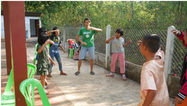
Our Christmas celebration: Fun, ...