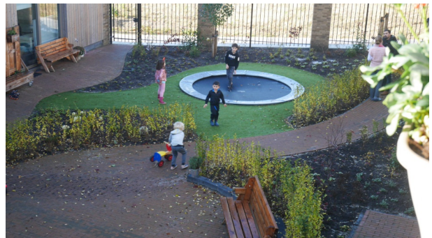
The children can play safely in the inner courtyard of the house.