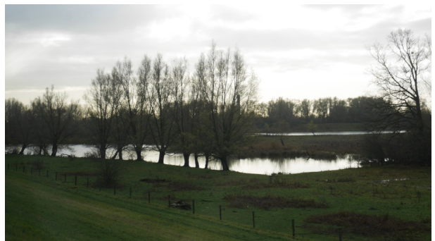
nature reserve Blauwe Kamer