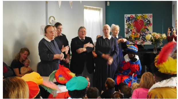
The Sisters join in wholeheartedly.