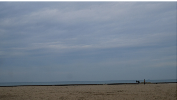
North Sea near Scheveningen