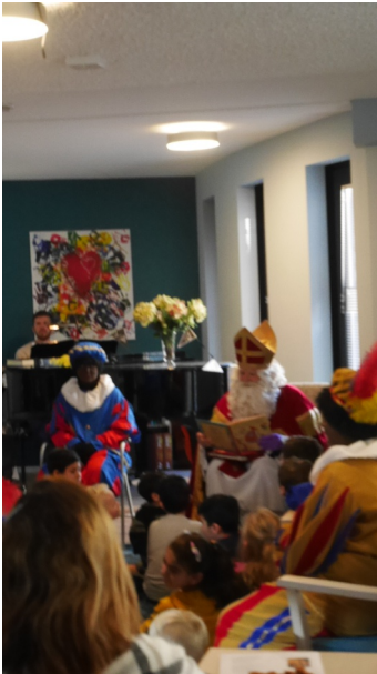
Sinterklaas and the zwarte Pit