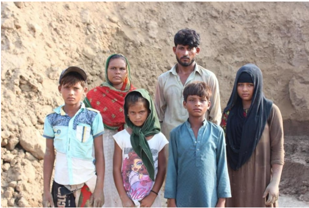
Family Sohail in the brickyard before the ransom