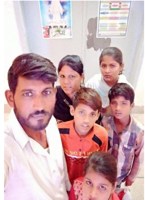
after the ransom on 4. 9. 2020