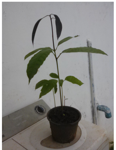
Shoot of a Mango tree, grown from the kernel of the fruit of one of our Mango trees