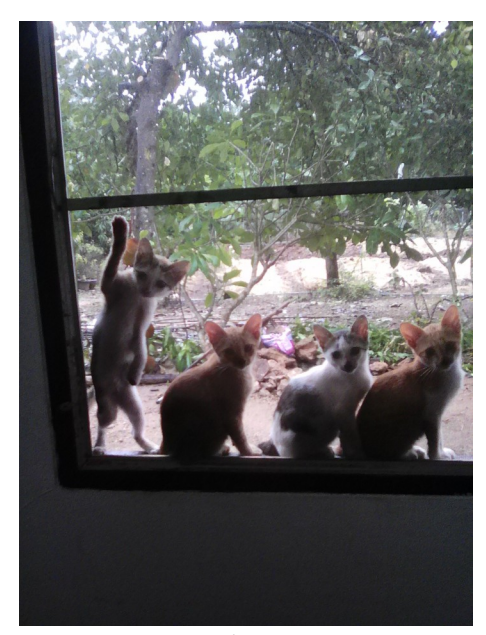
Our 4 cat orphans