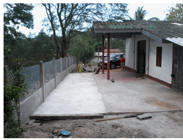
House 1: Our new garden fence