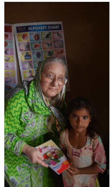
... to learn to read and to write