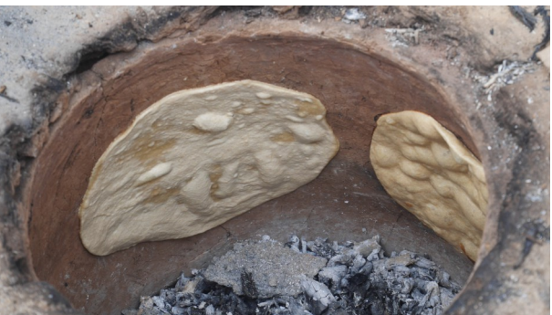
baking bread Pakistani style