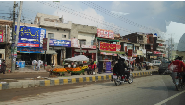
besides a main road