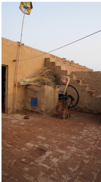
in front of flats for brick kiln workers