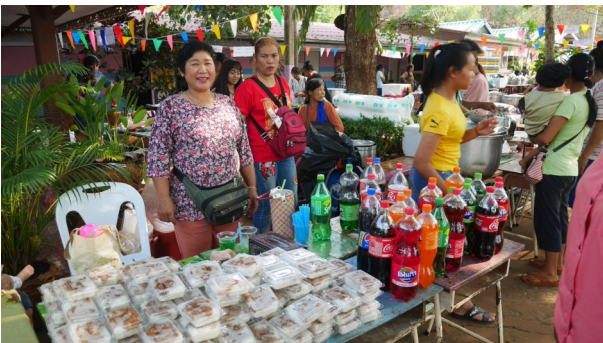
Many offered food and drink.