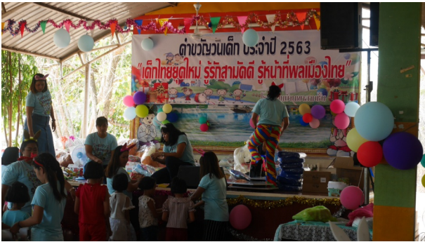
Motto of the Children's Day 2020: The children of Thailand commit themselves anew to preserve the unity of the state and to know the duties of the Thai people.