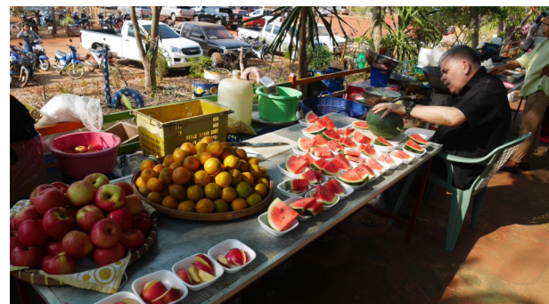
Pure cut watermelon.