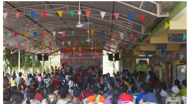
Performances in the large hall