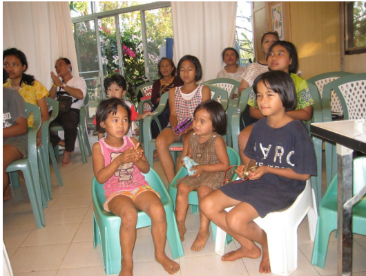
listening to the sermon