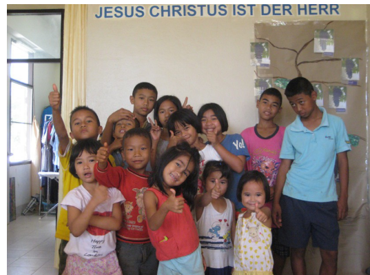
Today many came to our Service.