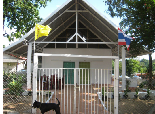
entrance seen from west