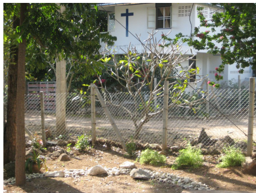
view towards south west towards our main house