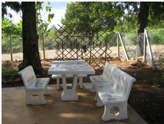
the north west corner of the garden