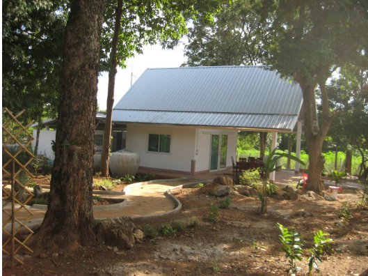
seen from north west